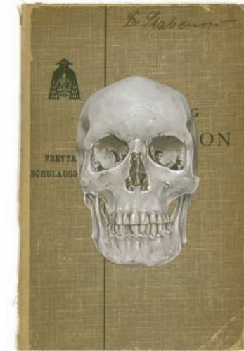
Shannon Dmote Peel